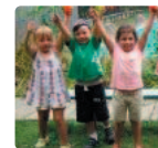
The Family Schools