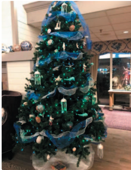
The magnificent Christmas Tree at The Cape Codder Resort in Hyannis.

ARTICLE | BUSINESS | JANUARY 17, 2019 03:18 PM | BY CAPECODTODAY STAFF