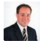
Hudson Eldridge Insurance-Division of HUB International New England, LLC