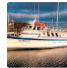
Yankee Deep Sea Fishing