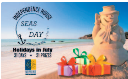
Independence House offers 31 days of prizes in their "Seas the Day" raffle (Courtesy photo)

ARTICLE | BUSINESS | JUNE 25, 2018 07:43 AM | BY CAPECODTODAY STAFF