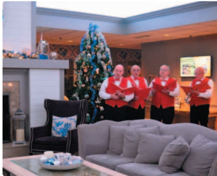
The Cape Cod Surftones sing Christmas carols next to the Giving Tree at The Cape Codder Resort in Hyannis

ARTICLE | NEWS | NOVEMBER 23, 2017 06:00 AM | BY CAPECODTODAY STAFF