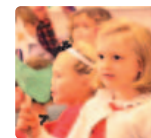
Family School/Saltbox School